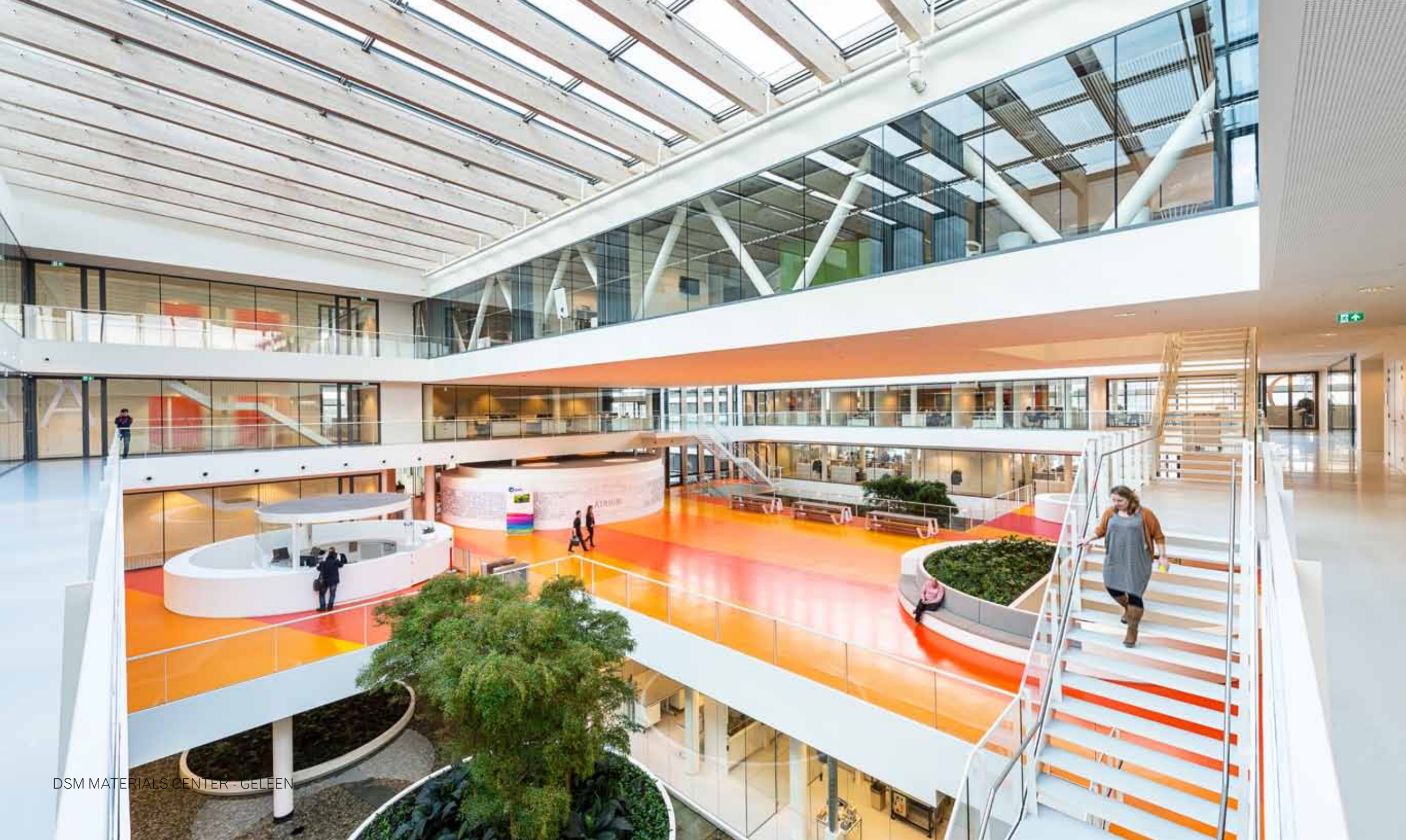
DSM MATERIALS CENTER - GELEEN