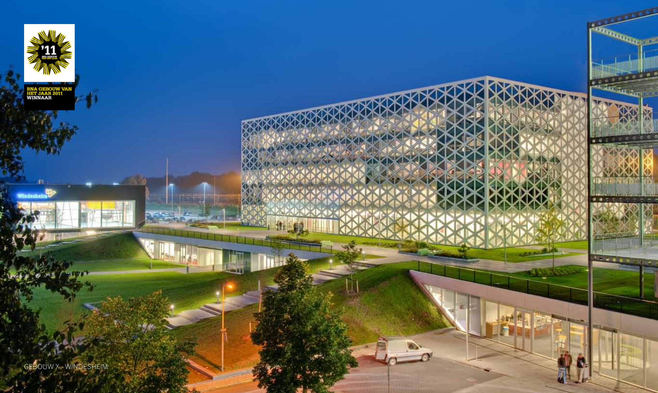
GEBOUW X - WINDESHEIM