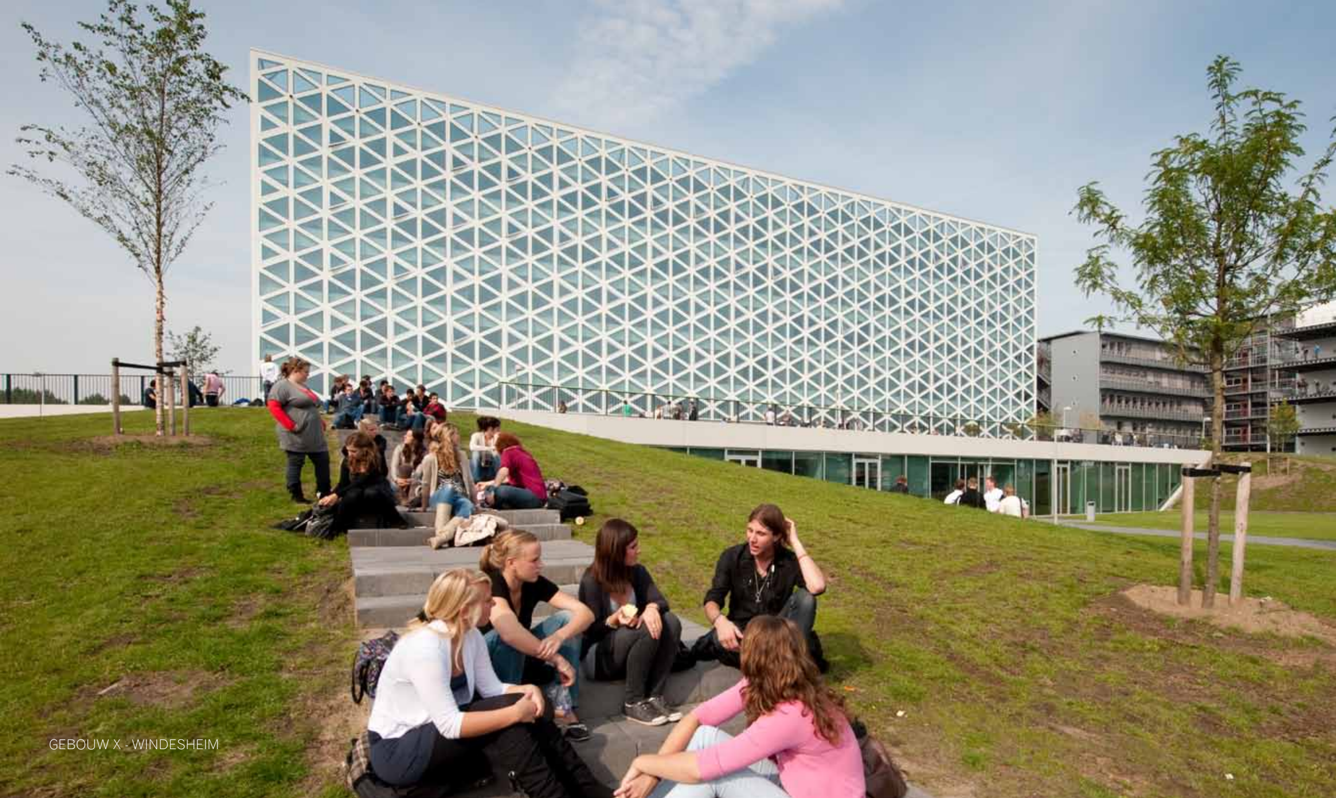
GEBOUW X - WINDESHEIM