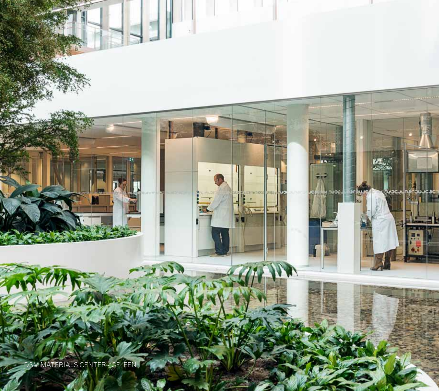
DSM MATERIALS CENTER - GELEEN