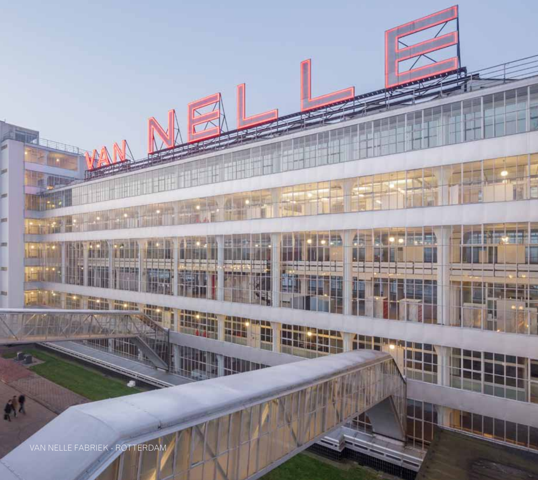
VAN NELLE FABRIEK - ROTTERDAM