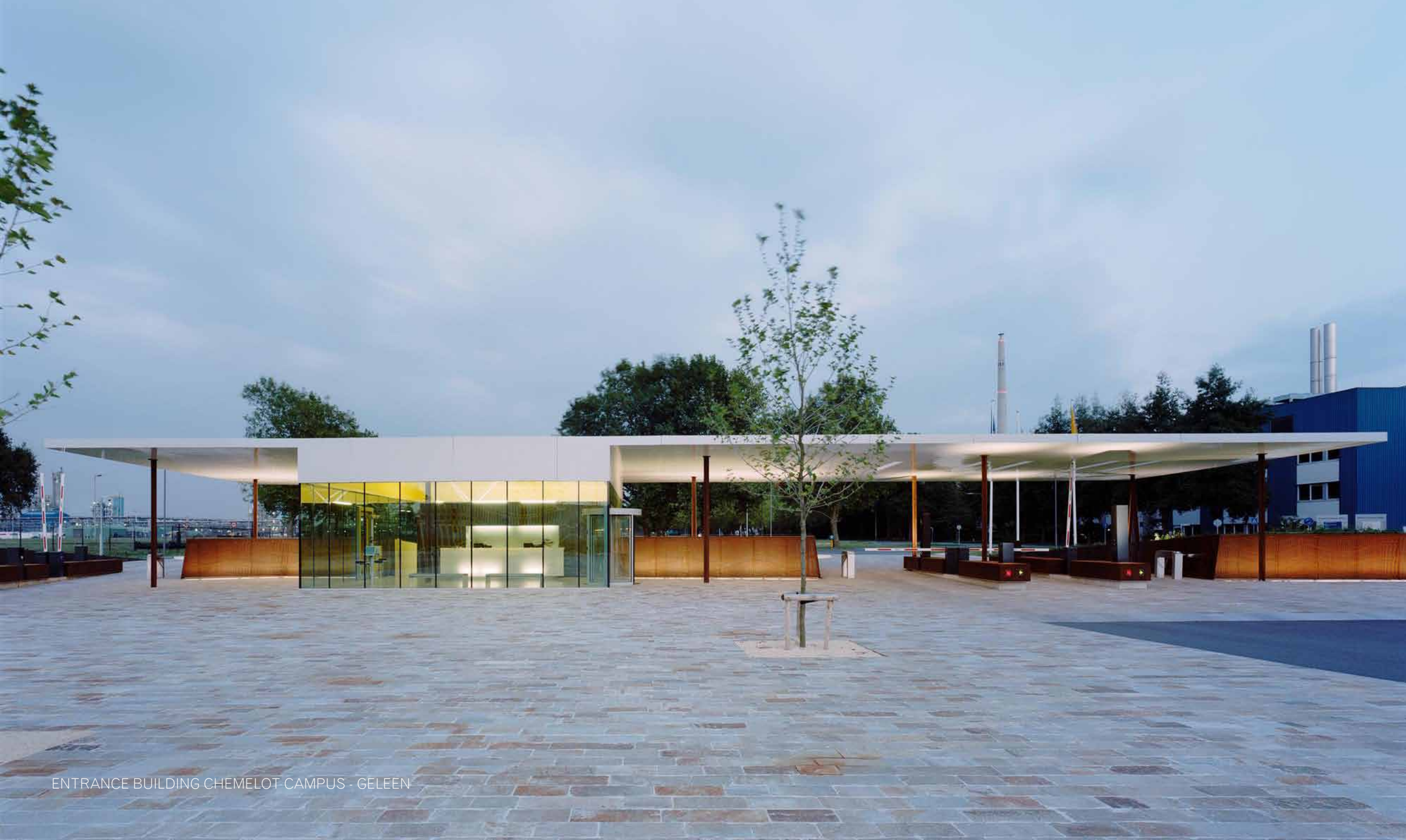
ENTRANCE BUILDING CHEMELOT CAMPUS - GELEEN