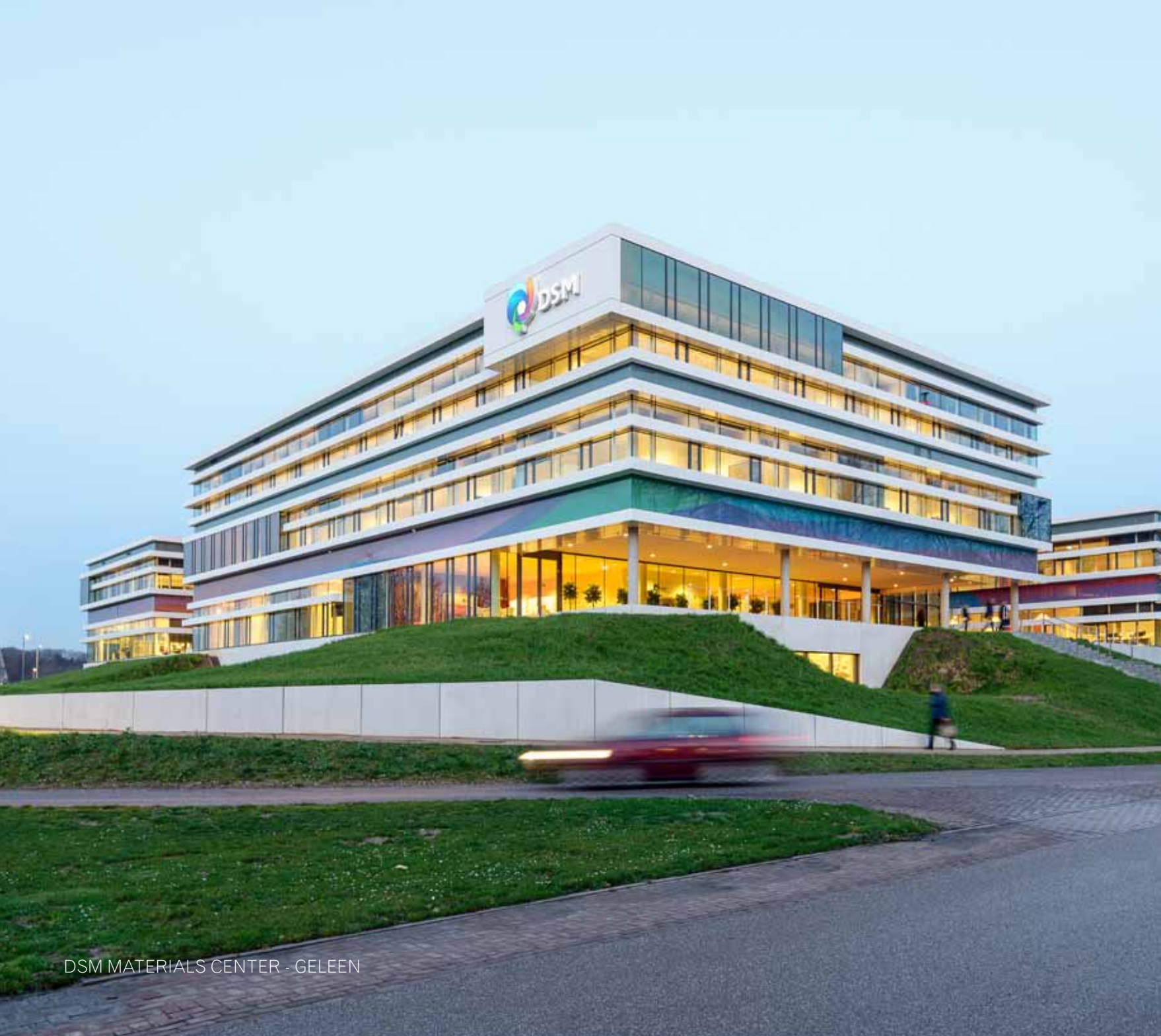
DSM MATERIALS CENTER - GELEEN