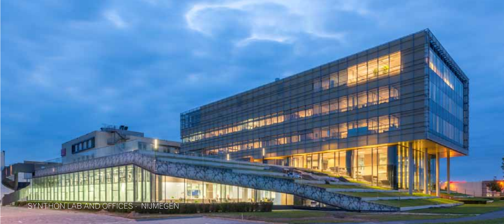
SYNTHON LAB AND OFFICES - NIJMEGEN