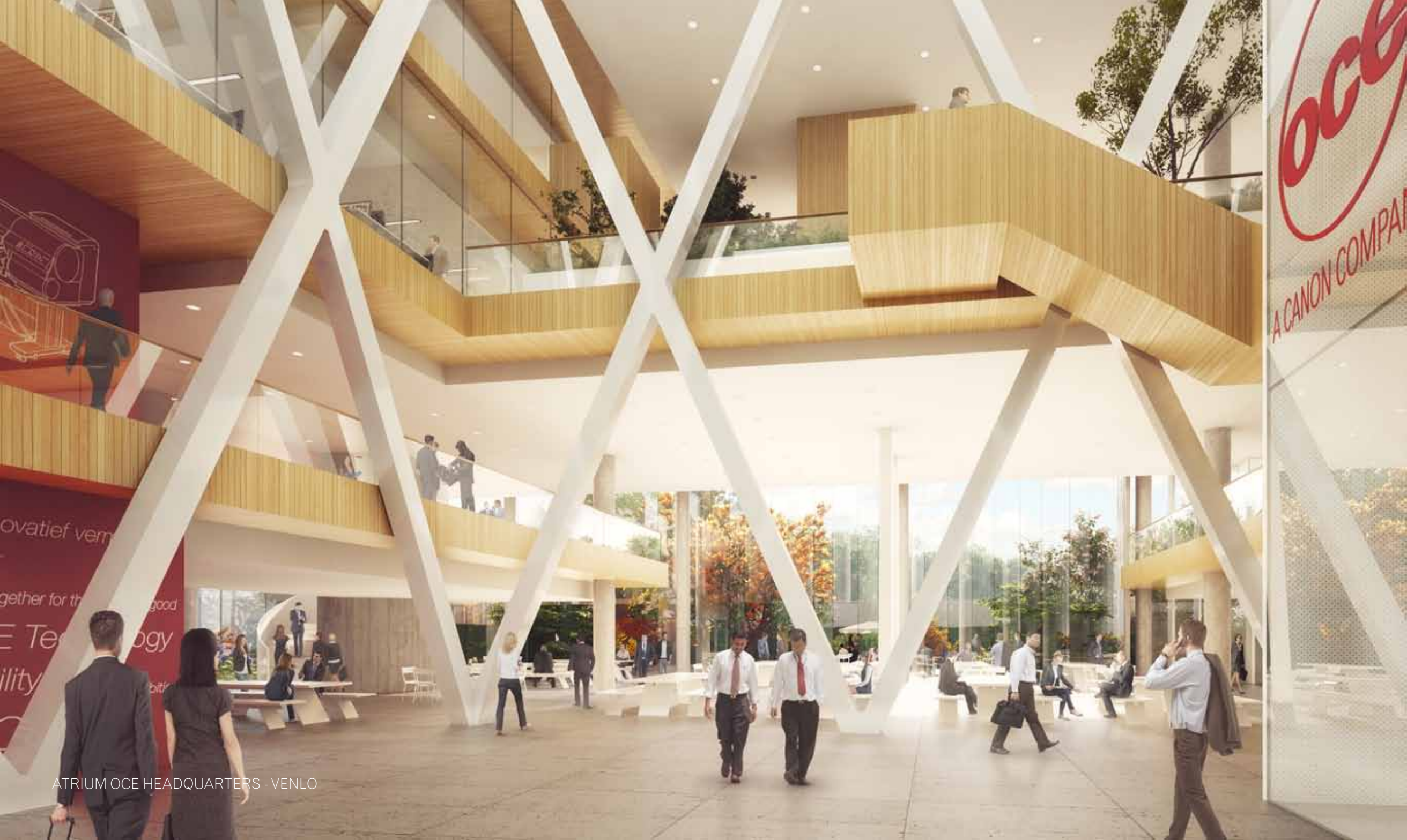
ATRIUM OCE HEADQUARTERS - VENLO