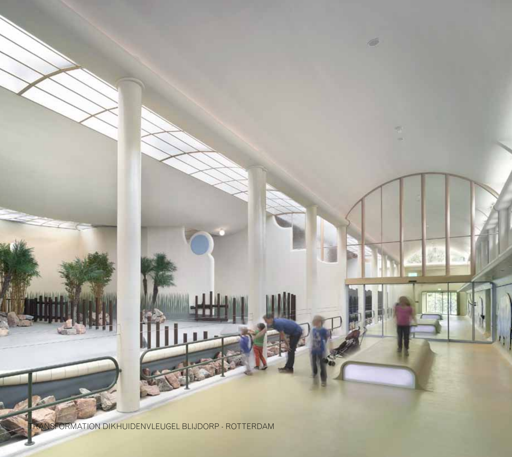
TRANSFORMATION DIKHUIDENVLEUGEL BLIJDORP - ROTTERDAM