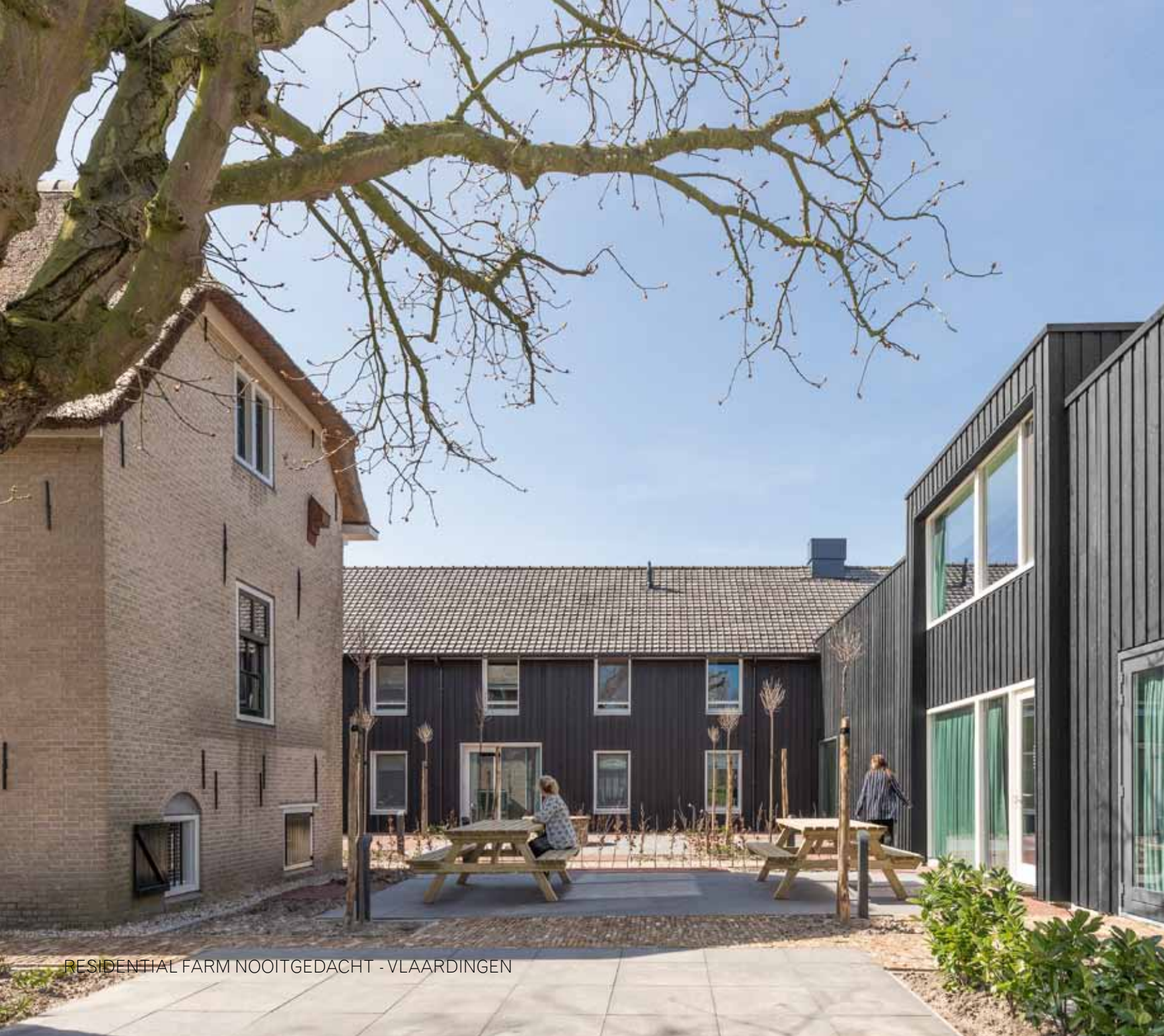
RESIDENTIAL FARM NOOITGEDACHT - VLAARDINGEN