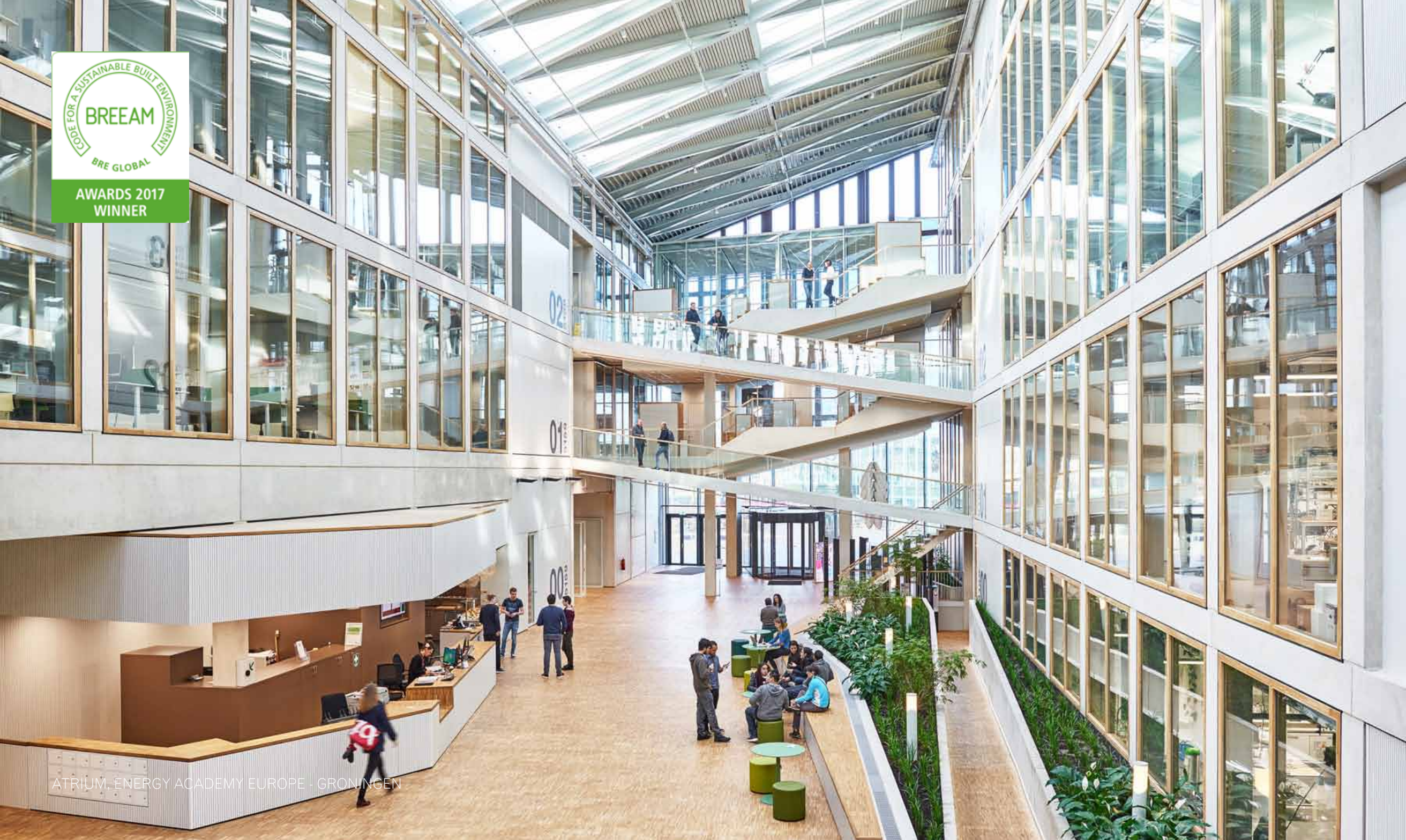
ATRIUM, ENERGY ACADEMY EUROPE - GRONINGEN