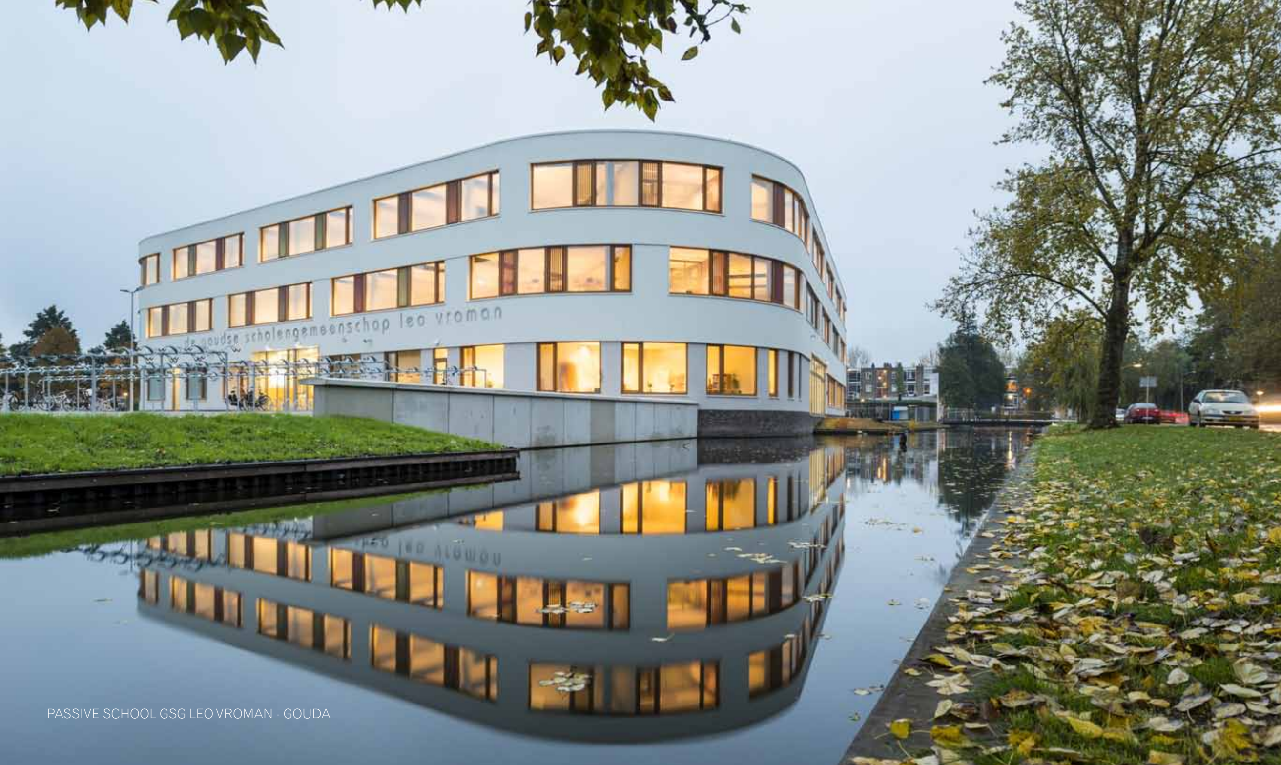
PASSIVE SCHOOL GSG LEO VROMAN - GOUDA