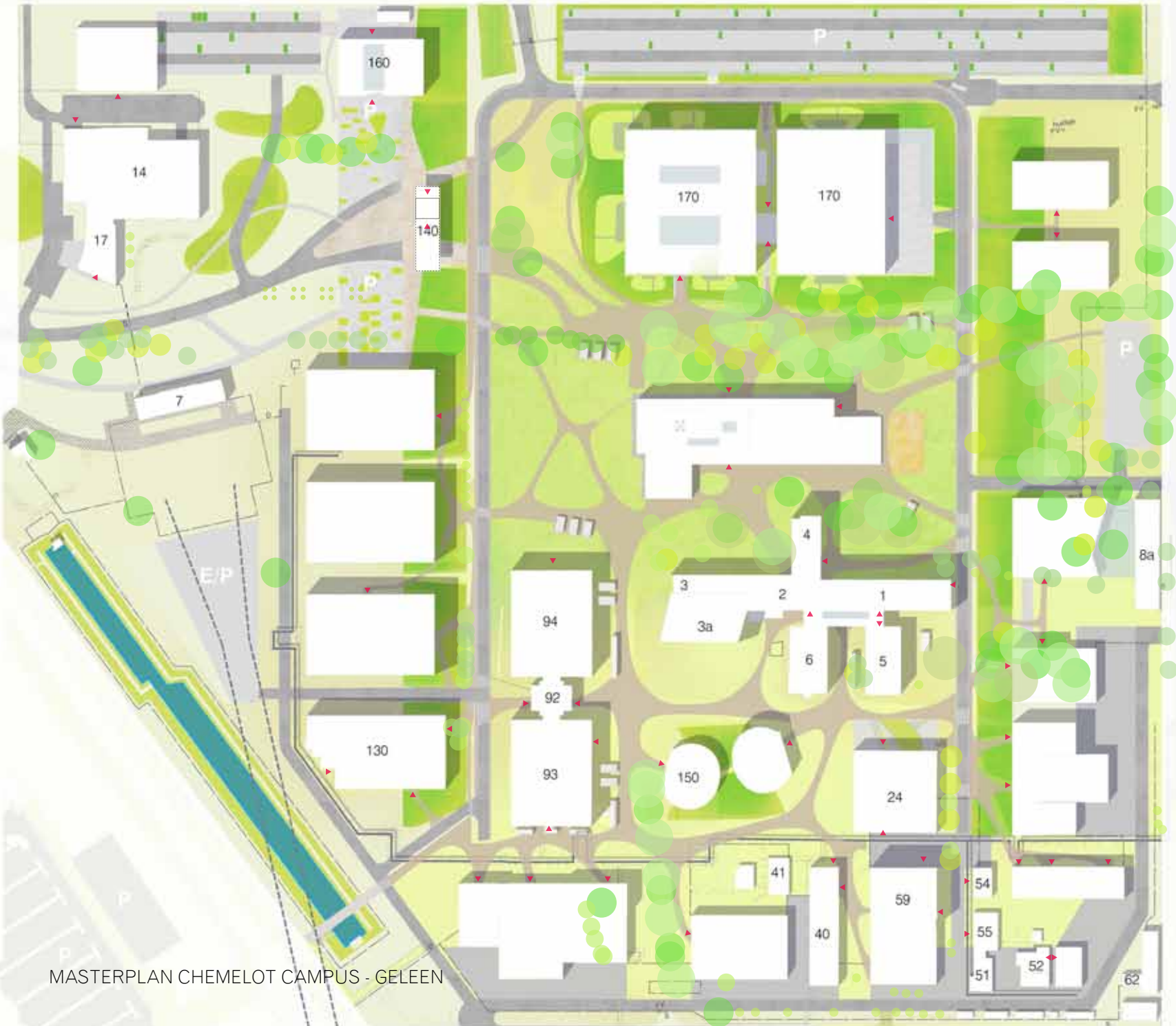
MASTERPLAN CHEMELOT CAMPUS - GELEEN

Connecting, futureproof, flexible and sustainable: those are values that have formed the base of all our masterplans. For over 20 years we have been working on various masterplans in which we aim for a high-quality environment with an optimal relation between the various functions, with a particular attention to meetings and communities.