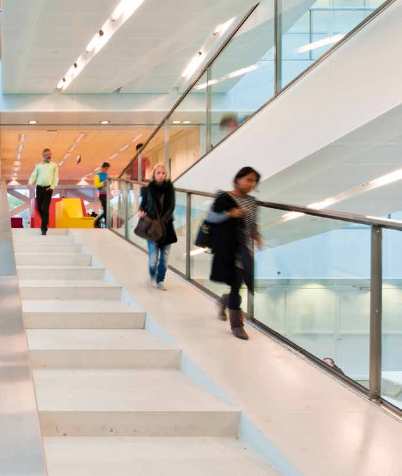
ATRIUM, GEBOUW X - WINDESHEIM