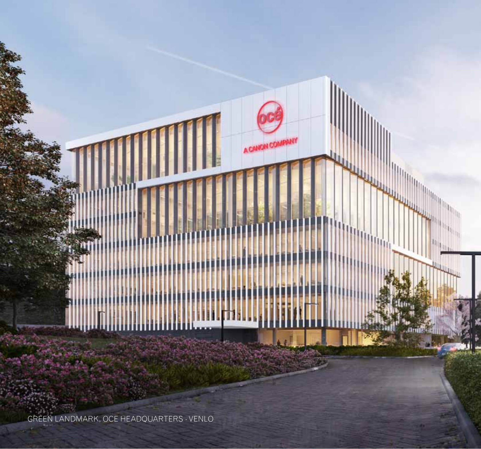
GREEN LANDMARK, OCE HEADQUARTERS - VENLO