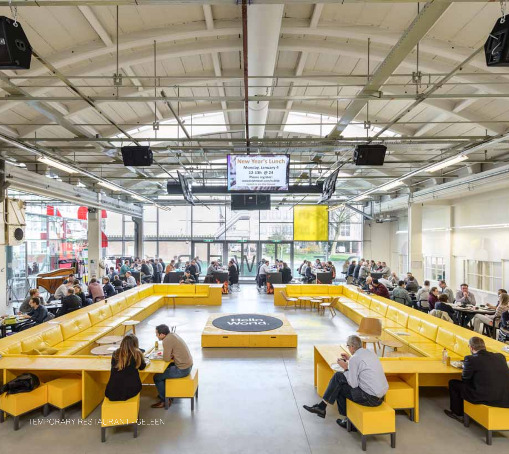
TEMPORARY RESTAURANT - GELEEN