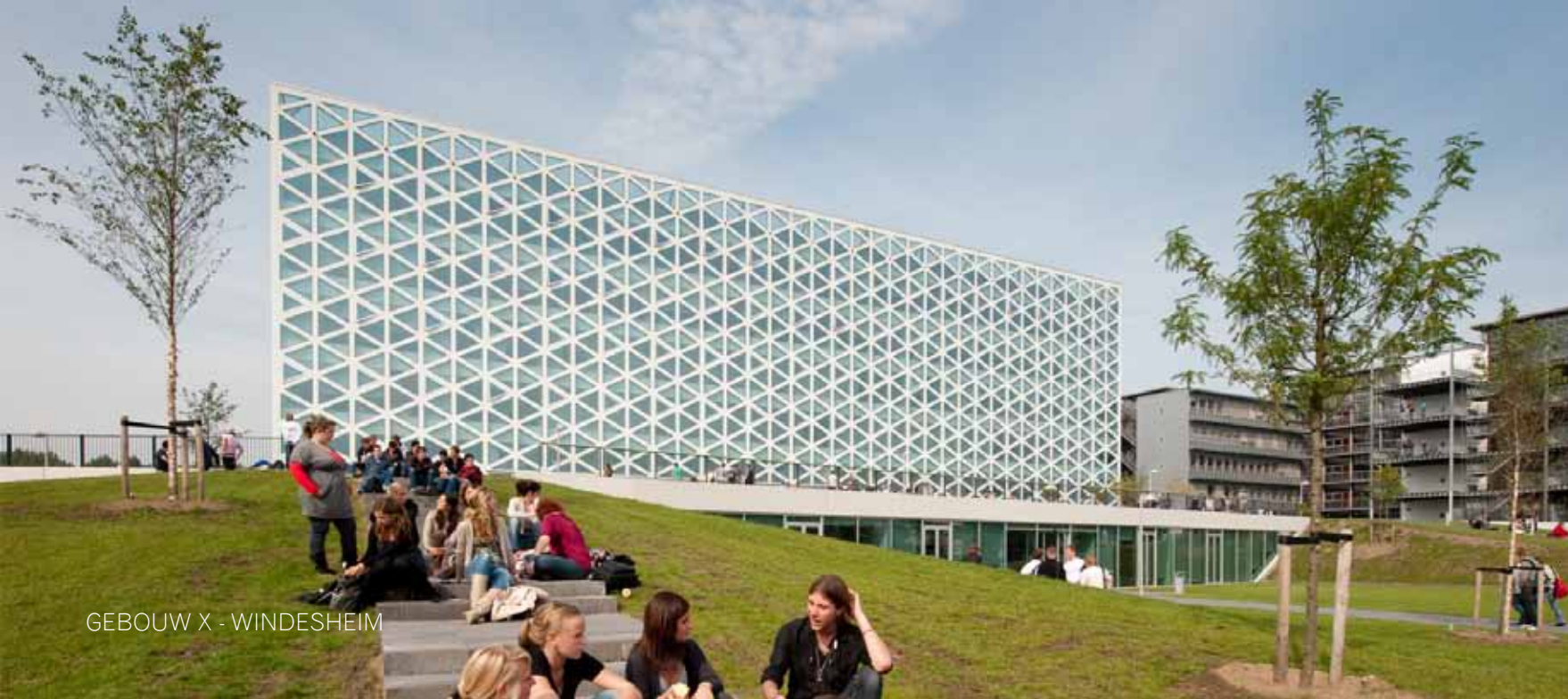
GEBOUW X - WINDESHEIM