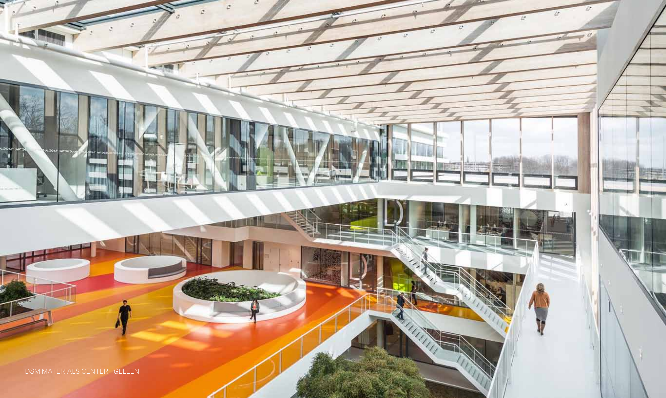
DSM MATERIALS CENTER - GELEEN