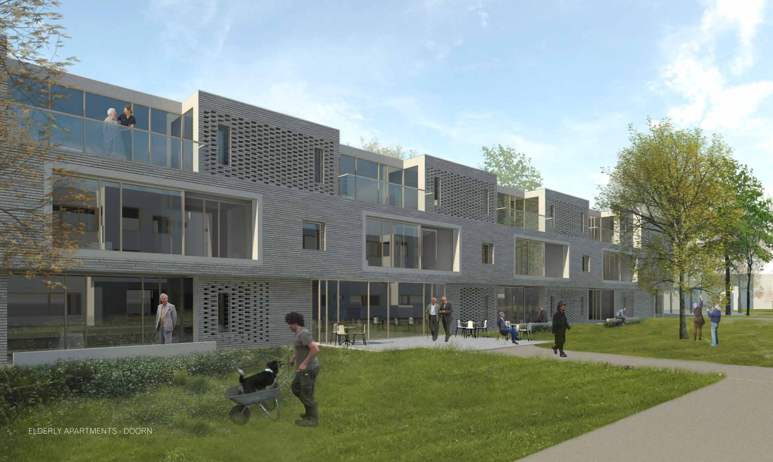
ELDERLY APARTMENTS - DOORN