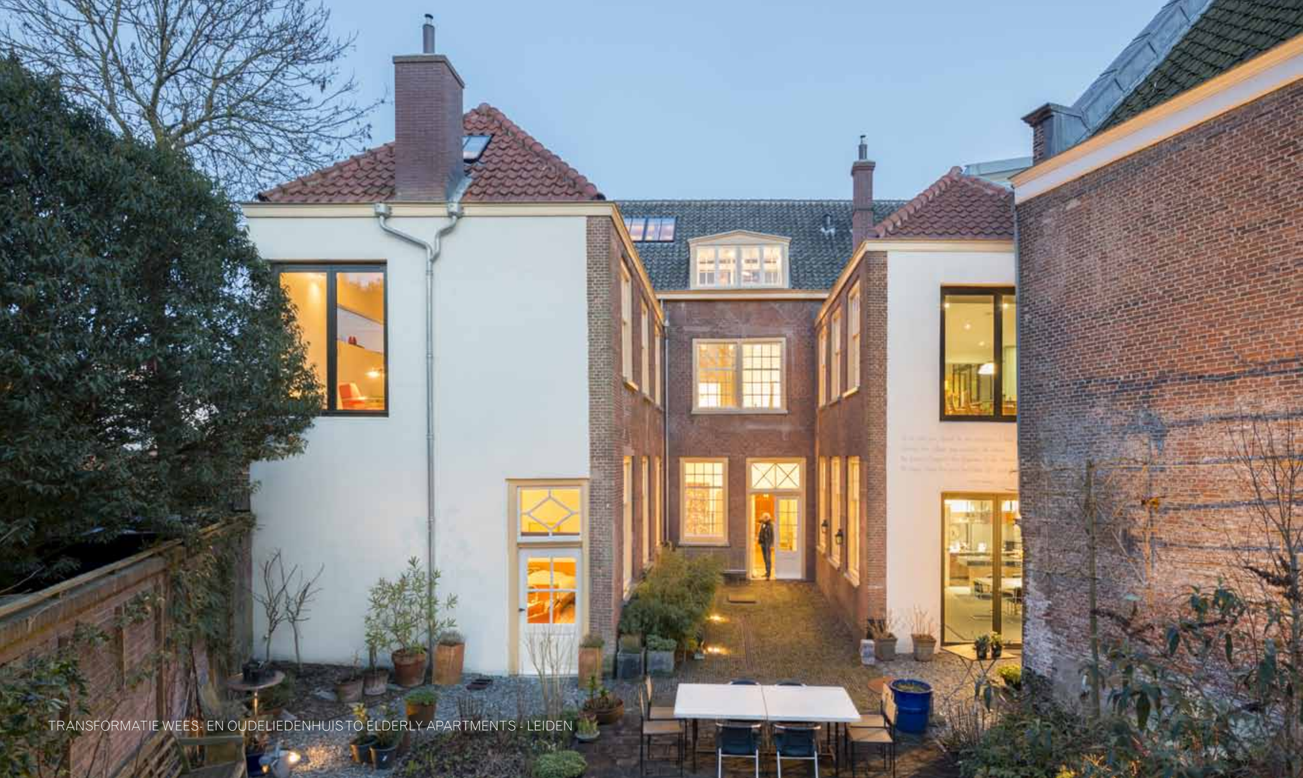
TRANSFORMATIE WEES- EN OUDELIEDENHUISTO ELDERLY APARTMENTS - LEIDEN