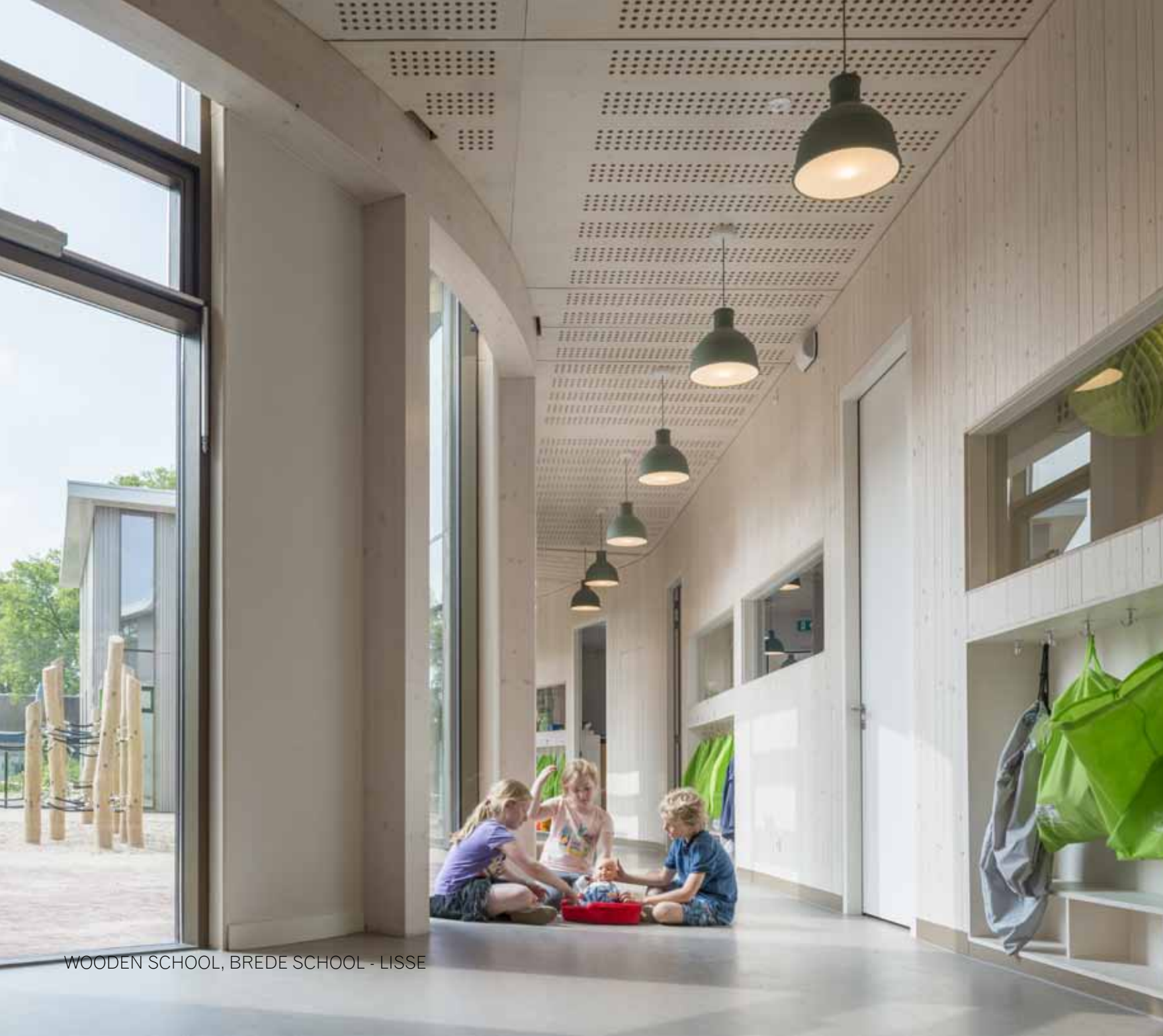
WOODEN SCHOOL, BREDE SCHOOL - LISSE